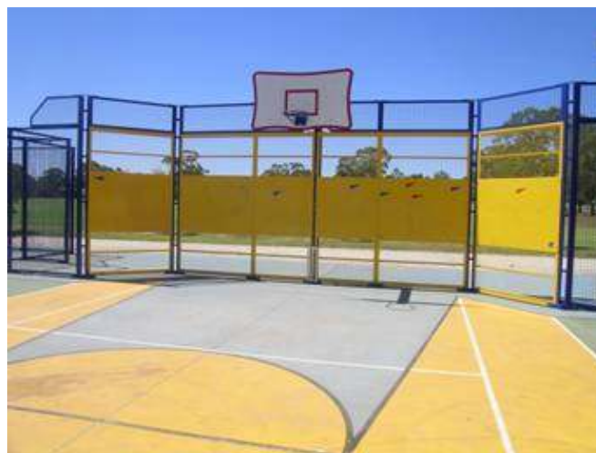
Above: The Playford Rage_cage is similar to the rage cage proposed by Council for Tuross Youth. .