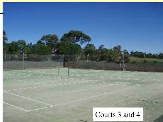
Courts 3 and 4