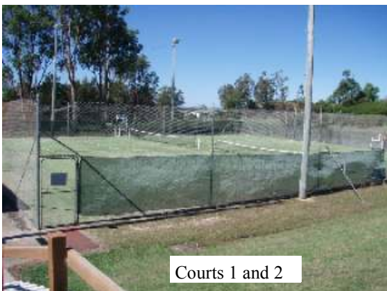
Courts 1 and 2