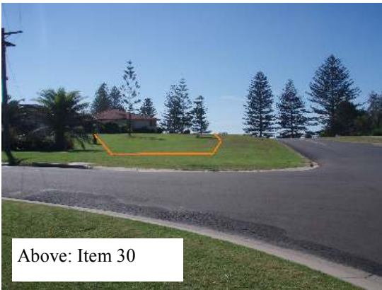
Table (11) Land for investigation for disposal by planning district of the Draft Strategy

WHAT SOME FOLK MIGHT HAVE OVERLOOKED IN THE DOCUMENT IS THE GREEN “INVESTIGATION” PARCEL OF LAND AT THE CORNER OF BEACH ROAD AND TUROSS BOULEVARDE and a Pathway that runs between Hood Cres and Trafalgar Road as listed in